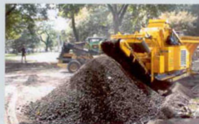
Success factor quality and pure sorting: up to 80 t/h cubic value grain from building debris, asphalt, concrete and in landscape design