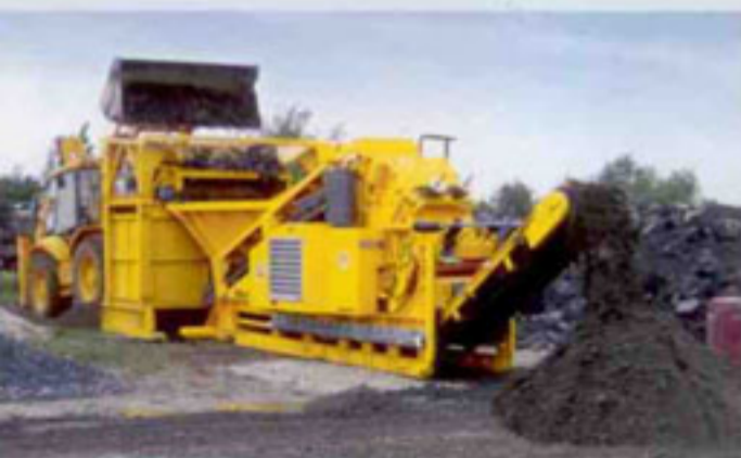
Less wear through pre-screening: the robust VS60 – also available with side conveyor belt – separates fines from the feed material

The impact crusher is easy to operate and all service jobs can be carried out from ground level. With high-performance components such as pre-screens and final screens, you can create a complete recycling centre. The building contractor becomes a service provider for companies and communities, creating clear, cost-efficient recycling loops. RUBBLE MASTER partners offer advice on optimum settings and site logistics on a case-to-case basis.