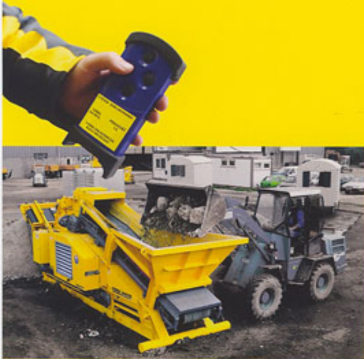
Easy handling: fed with small construction loaders (loading edge 190 cm), remote control optional