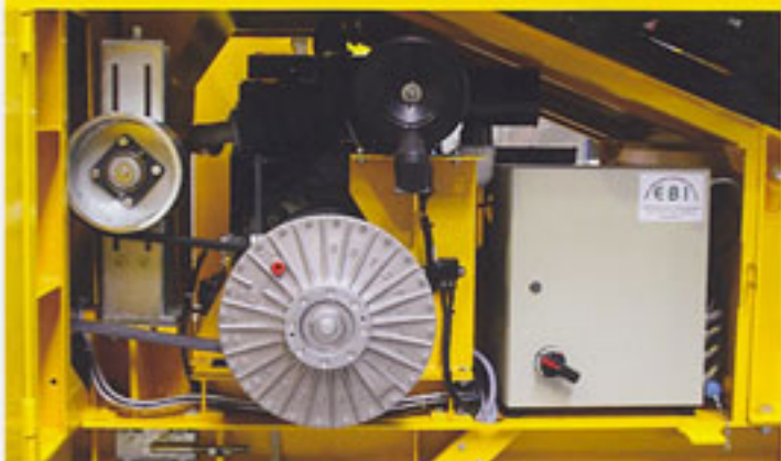
Efficient: automatic 2-step conveying and diesel / electric drive (9 to 12 l)

RUBBLE MASTER Compact Recyclers are the compact class for mobile processing: they are versatile in use, powerful and stable in value. They produce high-quality cubic value grain from construction debris and natural rock on-site and cost effectively. Thanks to their compact dimensions and low weight, they can be transported without any special permits. Proven technology, individual advice and the RM Lifetime Support programme enable the RUBBLE MASTER user to offer affordable, mobile recycling and establish a profitable line of business with exceptional quality. Because we are only satisfied when our customers are successful!