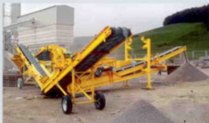
Profitable niches: recycled production waste can be separated in the container-mobile CS2500 and reused to save costs