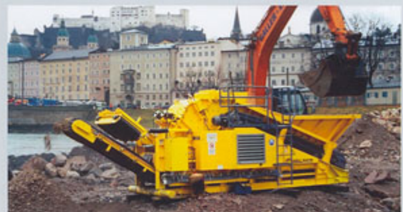
Appreciated by residents: thanks to series dust suppression and noise reducing cover