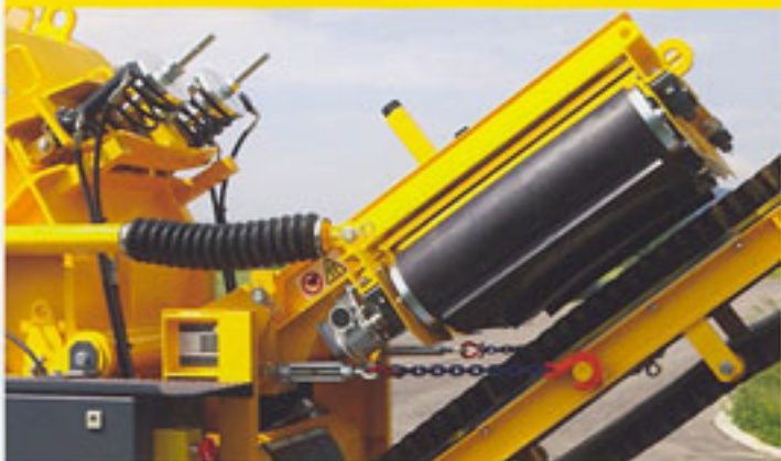
Indispensable: release system to remove blockages, plus reliable magnetic separator